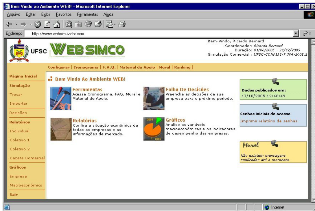
Figure 3 – Web site devised to integrate business games with the Internet

companies compete in groups of eight companies, thus forming an industry. The number of industries depends on the number of participants. All industries are of the same kind and there are no interactions between them. The company with the highest stock share value in each industry group after five simulated periods passes to the next contest round. At this point, there are two possibilities: the first one consists in repeating the methodology used in the first round and in performing additional rounds until the winners are known. In the second one, considering that the number of participants can achieve thousands, the winners can be determined in the second round. In order to do that, the Web Simulator is prepared to rank the stock shares of all companies together, despite which industry they are in. Also, no confidential business reports can be assessed by all companies. By so doing, it is possible to observe companies with the highest stock shares, period to period, and to analyse business strategies used by the best performed companies.