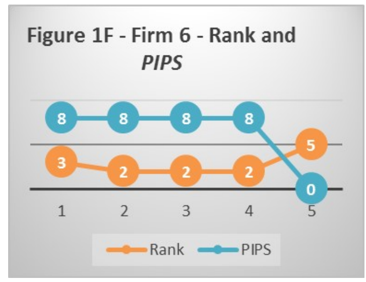
Page 151 - Developments in Business Simulation and Experiential Learning, Volume 43, 2016