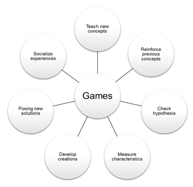
EXHIBIT 1 PURPOSES OF EDUCATIONAL GAMES

Prepared from Gómez (2008), Lupano and Castro (2008).