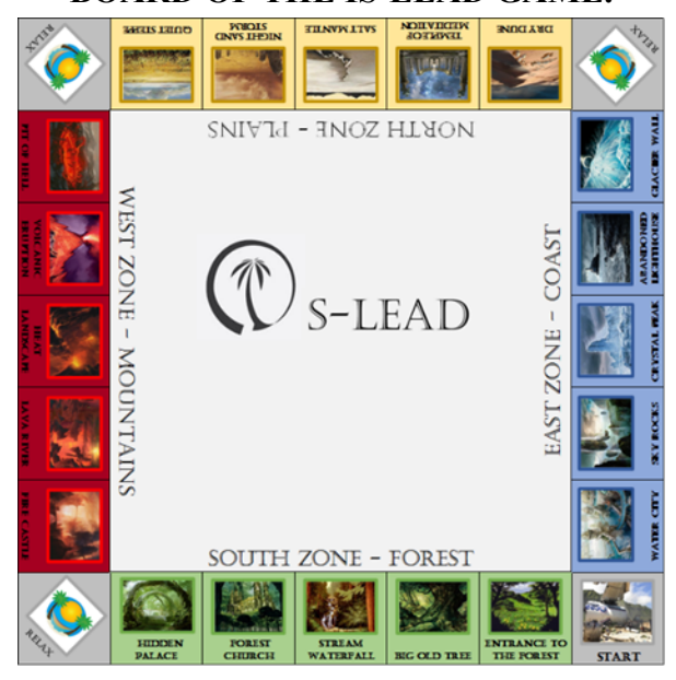
EXHIBIT 5 BOARD OF THE IS-LEAD GAME.

The efficiencies of the sessions were found above 70%, which indicates that the participants responded to the situations presented, largely focused on leadership and ethical responses, to detail the percentages of scenarios with scores of 4, 2 and 1. Review exhibit 6.