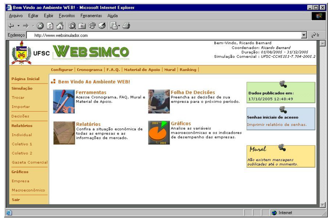
Figure 3 – Web site devised to integrate business games with the Internet

companies compete in groups of eight companies, thus forming an industry. The number of industries depends on the number of participants. All industries are of the same kind and there are no interactions between them. The company with the highest stock share value in each industry group after five simulated periods passes to the next contest round. At this point, there are two possibilities: the first one consists in repeating the methodology used in the first round and in performing additional rounds until the winners are known. In the second one, considering that the number of participants can achieve thousands, the winners can be determined in the second round. In order to do that, the Web Simulator is prepared to rank the stock shares of all companies together, despite which industry they are in. Also, no confidential business reports can be assessed by all companies. By so doing, it is possible to observe companies with the highest stock shares, period to period, and to analyse business strategies used by the best performed companies.